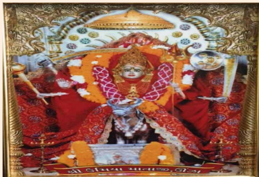
Shree Maa Umiya