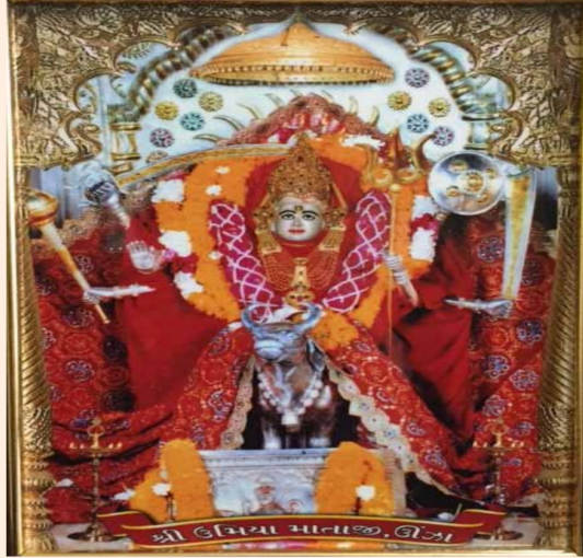
Shree Maa Umiya